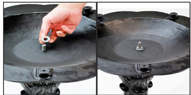
Screw nut on exposed end of threaded rod. Completely tighten with socket wrench.