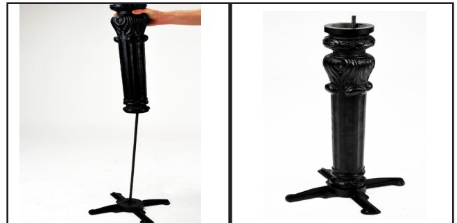
Flip column over; then guide rod through column.