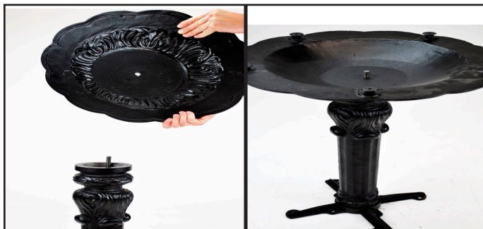
Flip base over and place on top of column. Make sure threaded end of rod is exposed through bottom of base.