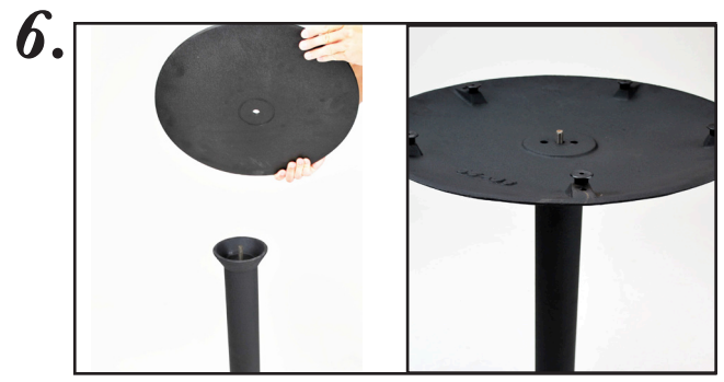
Flip base upside down and guide rod through base's center hole