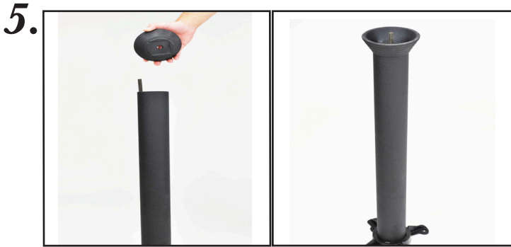
Flip collar upside down and guide rod through base's center hole