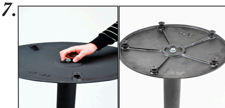
Use nut and screw onto exposed rod